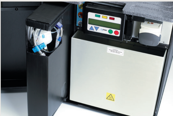
Integrated water treatment